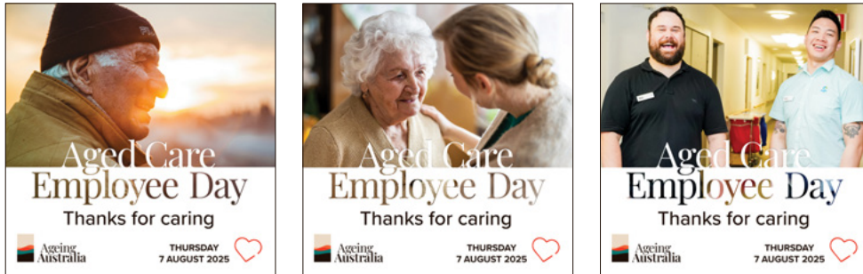
Download prepared social tiles