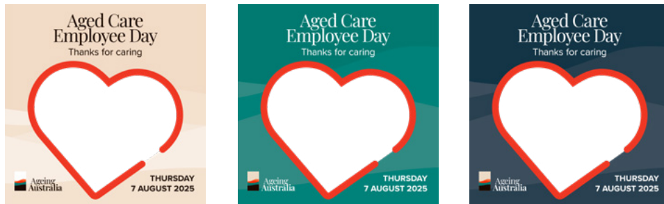
Download to add your photo – social tiles