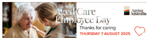
Download email banner image JPEG