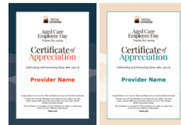
Thanks for Caring certificate